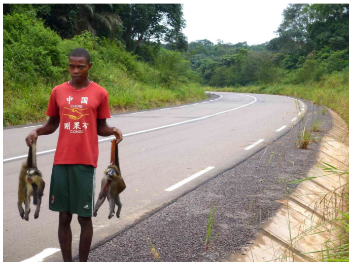
Figure 2. A poacher selling dead moustached monkeys ( Ceropithecus cephus ) for bushmeat along a Chinese-funded road cutting through a national park in the Republic of Congo. Many large development projects trigger uncontrolled secondary effects, such as wildlife poaching and illegal gold mining, that are not effectively countered by the EIA process.

On occasion, one even sees EIA consultants defending and promoting the project in public. In northern Queensland, Australia, for example, environmental experts